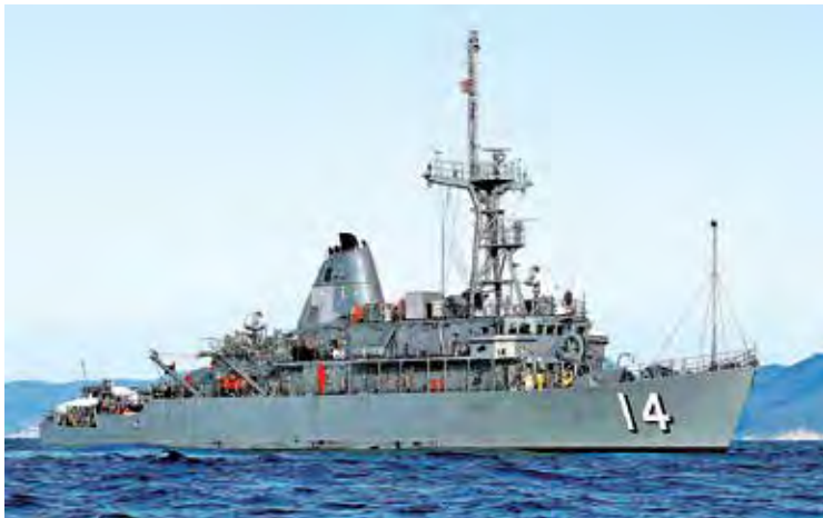
The Avenger-class mine countermeasure ship USS Chief (MCM 14)